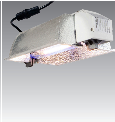
DE 1000Zh Reflector with lamp