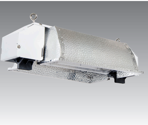
DE 1000Zh Reflector